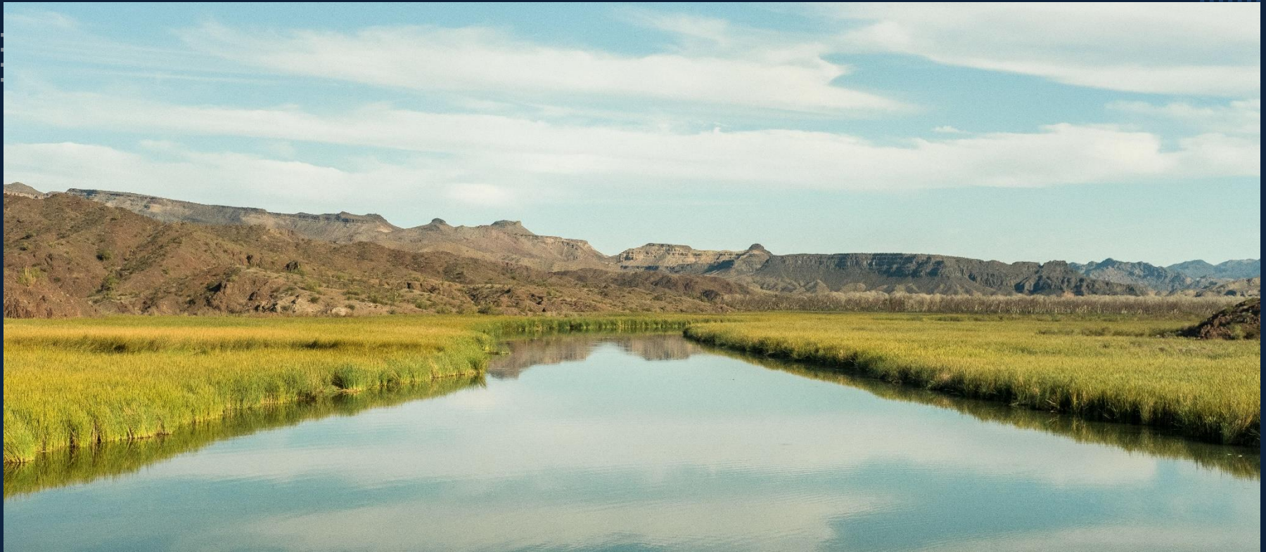
Colorado River in Mohave County | October 2022